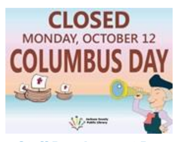
Staff Development Day