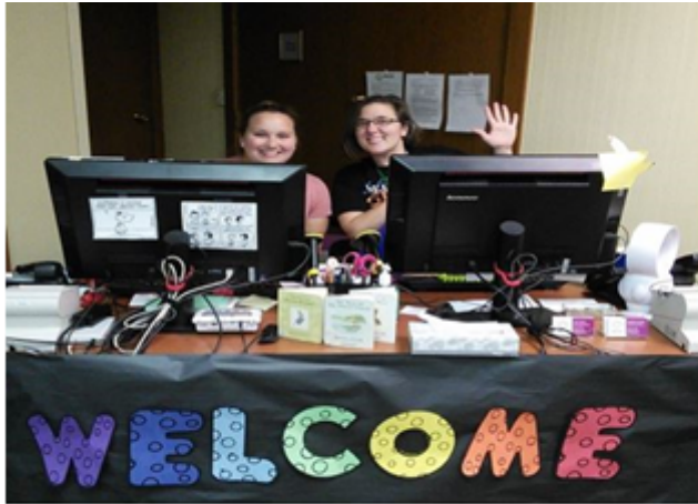
TEMPORARY KIDZ KORNER IN ACTION IN THE MEETING ROOM!