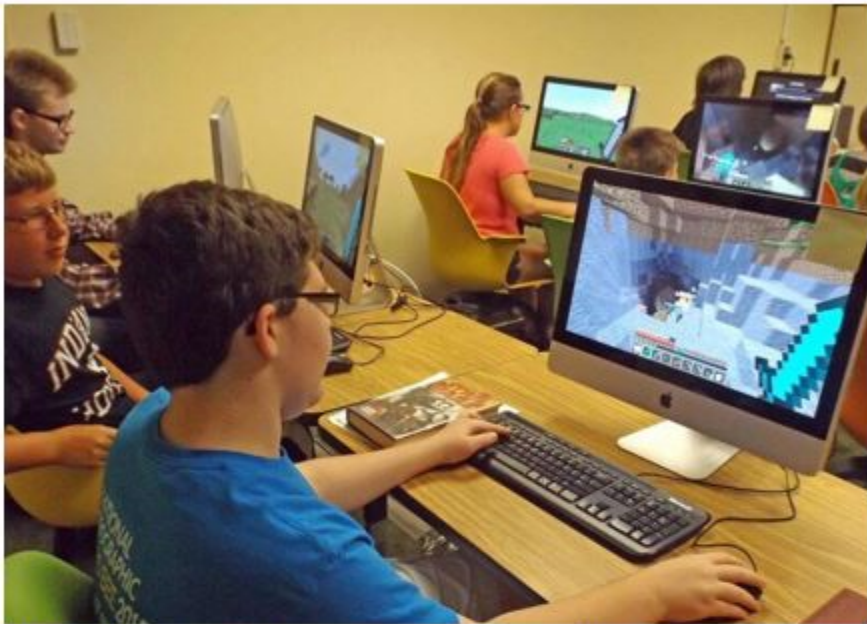
MINICON WAS A SUCCESS! THESE GUYS LOVED PLAYING MINECRAFT TOGETHER.